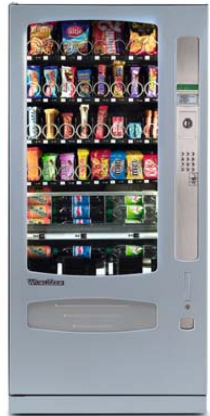
Wurlitzer 850 with special module for cans and PET bottles