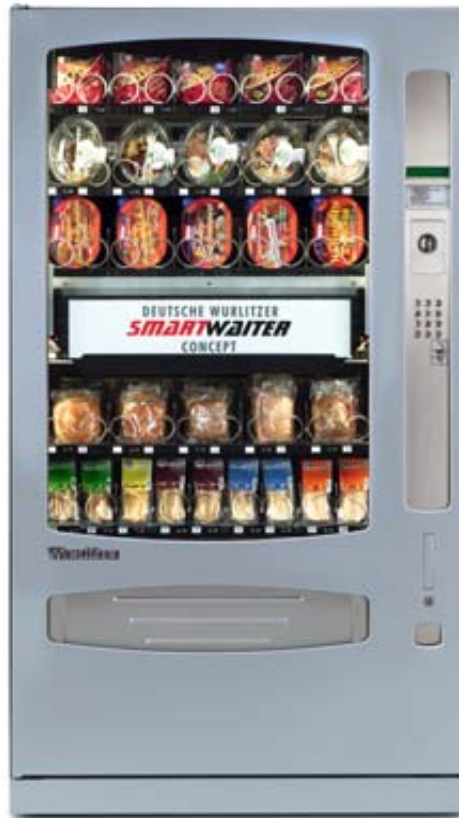
Wurlitzer 1000 – Food version with Smart Waiter

Both temperature levels and VarioTemp are possible from the same cooling unit. Both models are also available without cooling unit for vending of non-food products.